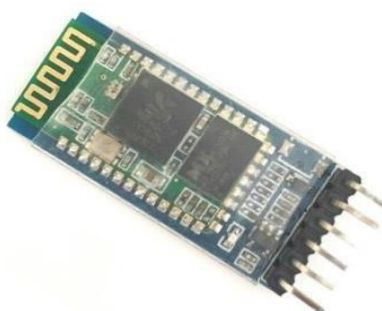
Figure 3: HC-05

HC-05 utilizes serial communication to communicate with the other devices. Generally, it is used to pair small components like mobile phones using a wireless communication to transfer a data. It can operate at the 2.45GHz frequency band. It can cover up to 10m without any contact.