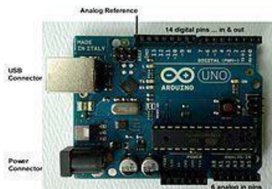
Figure 2: Arduino

Arduino is an open-source computer hardware used for building digital devices. Compared to other controllers, arduino has in build analog to digital converter and PWM controller. It has 28 bin with 8 bin for analog to digital supports. It has been programmed by using embedded c language.